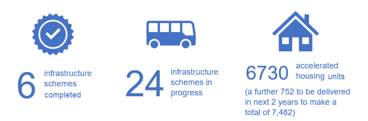
Figure 2: Infrastructure schemes delivered and in progress and associated housing units delivered through the Homes from Infrastructure programme as of 31 March 2023.

Oxfordshire County Council is now accountable for delivery of the remaining programme; a Memorandum of Understanding sets out commitments to positive partnership working, with particular regard to consulting with partners over any proposed changes to the programme of infrastructure delivery.